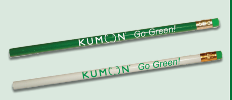
limited-edition "Go Green" pencils